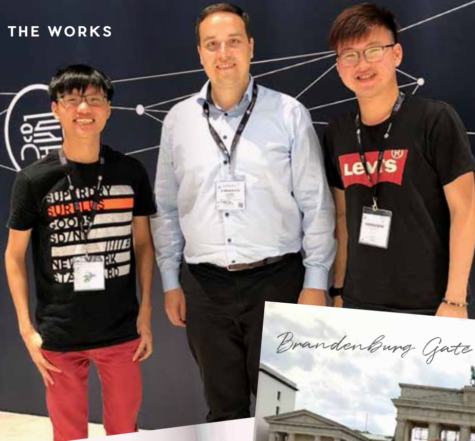
InnoTrans Exhibition Berlin - September 2018