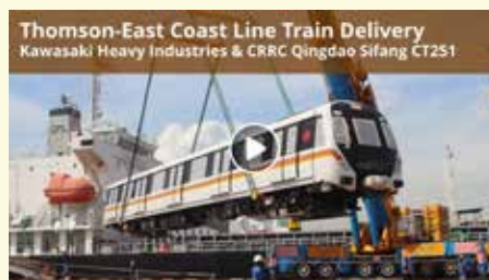
▶ Watch SG Trains' video of their visit to Jurong Port