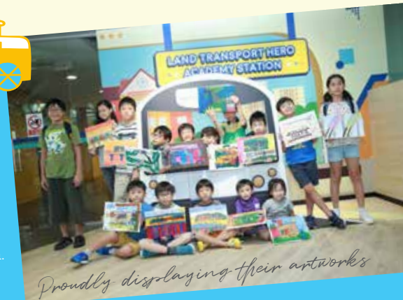
Proudly displaying their artwork's

The Friends from SGTrains were on hand to quiz the children on public transport etiquette and gracious behaviour, and answer their many queries on the intricacies of our land transport system.