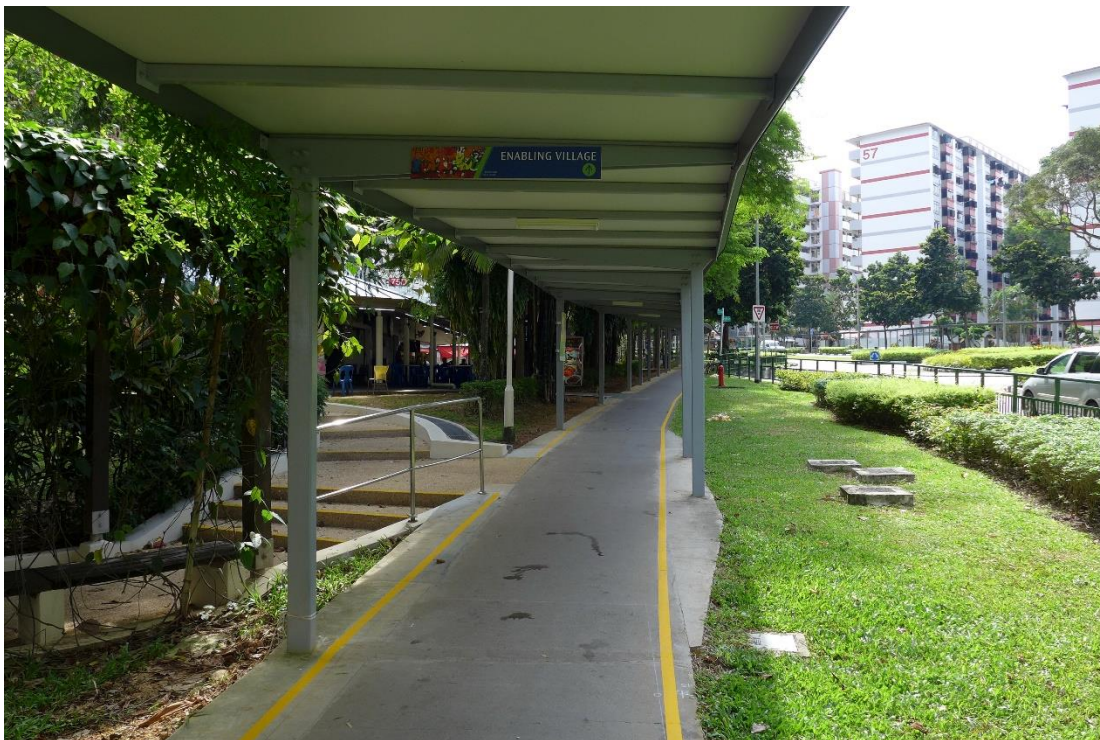
Directional signage and edge markings along footpath to Enabling Village