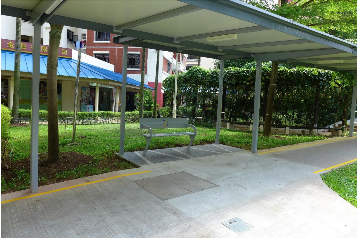
Four rest stops were built en-route from Redhill MRT station to the Enabling Village. Edge markings are also implemented to provide visually contrast cues for the partially-sighted