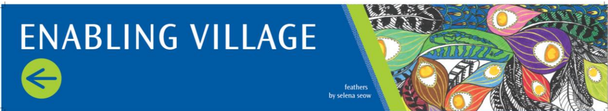
Directional signage designed in collaboration with SG Enable and The Art Faculty