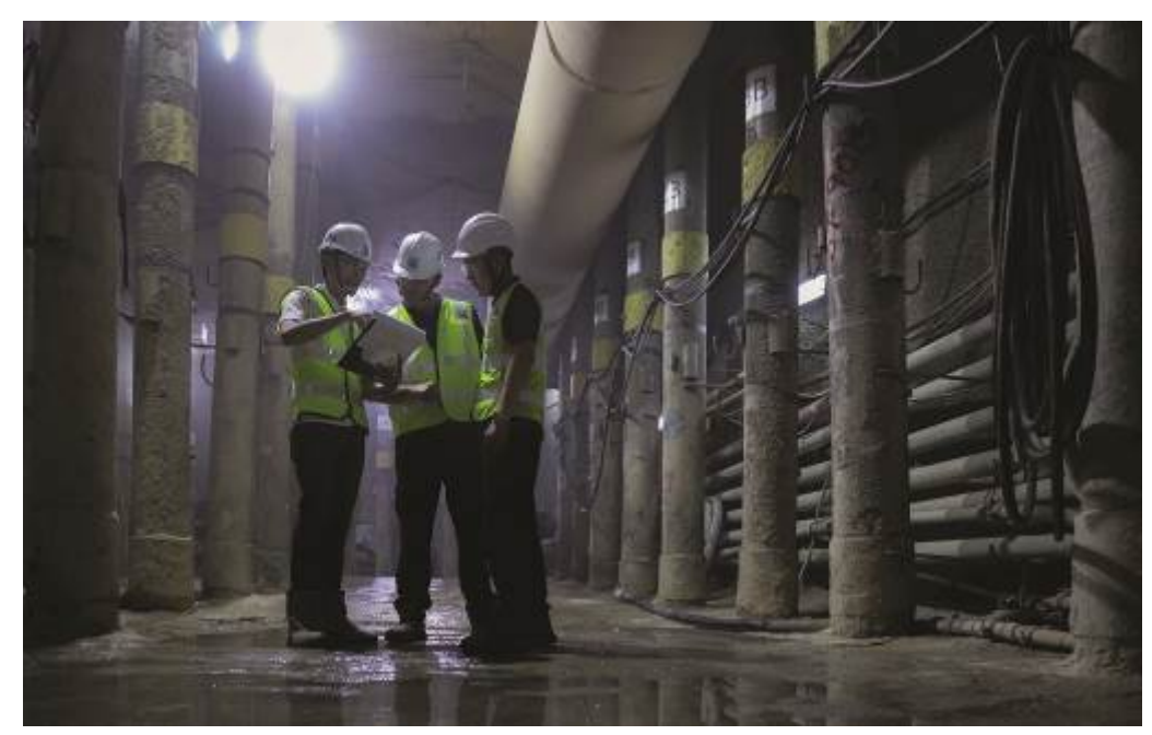
Getting Work Done Together