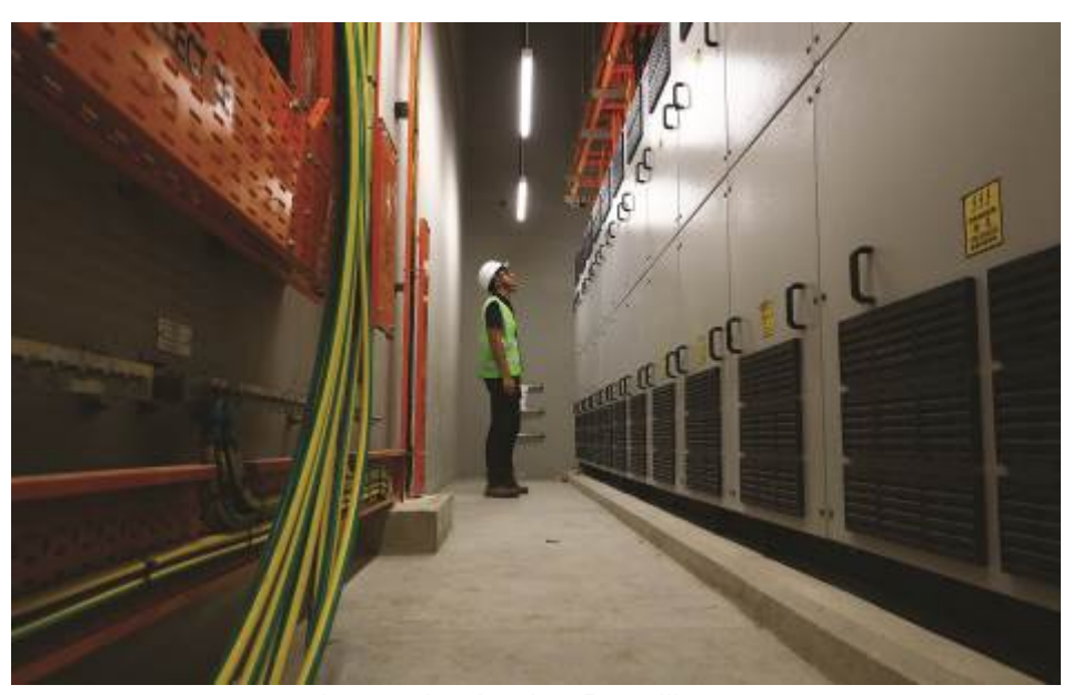
Inspection by Jun Pagalilauan