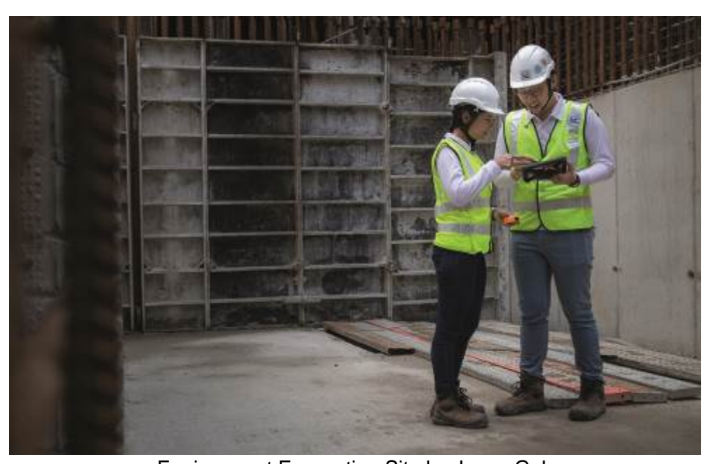
Engineers at Excavation Site by Jason Goh