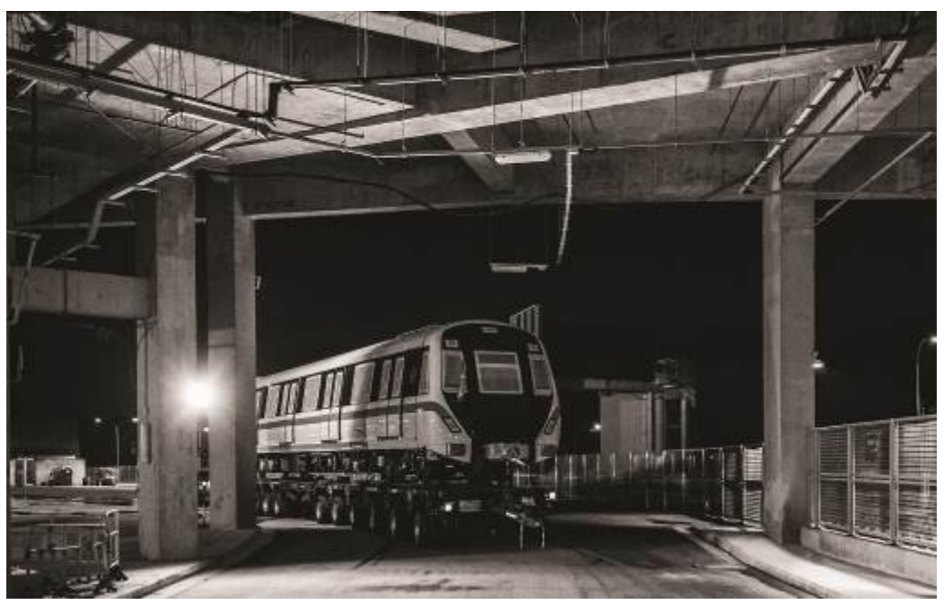
Arrival of New Trains on Site by Ryan Cheng