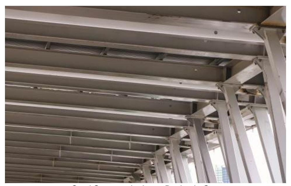
Steel Structure by Isaac Benjamin Ong