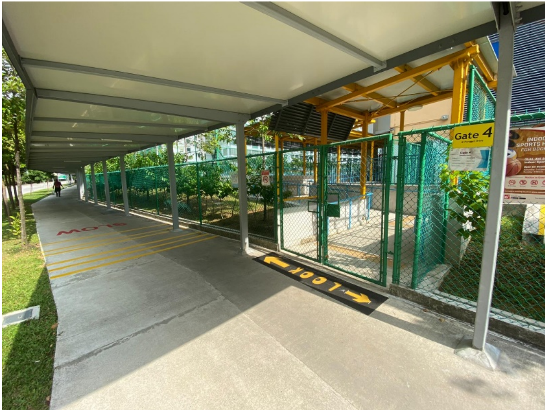
(B) Safety enhancements for footpaths near bus stops