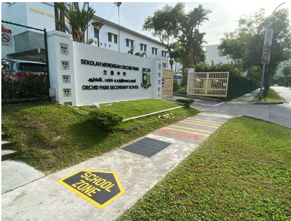
(A) School zone markings on footpaths