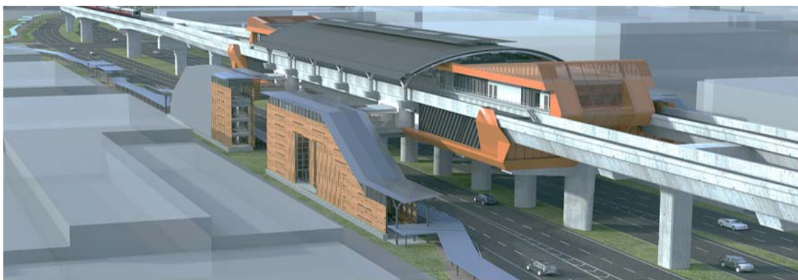
Artist Impression of JS10 Station