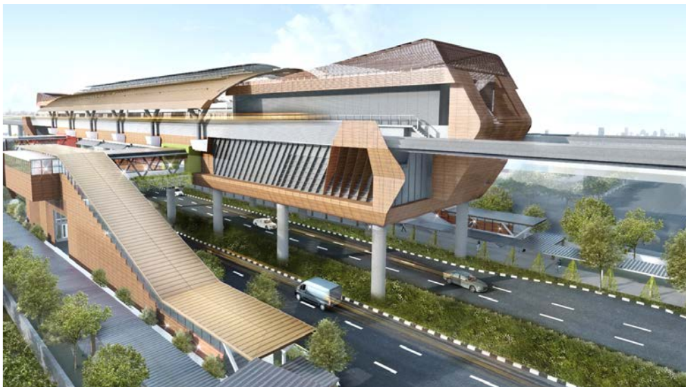
Artist Impression of JS9 Station