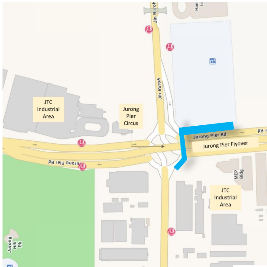
Location of JS12 Station