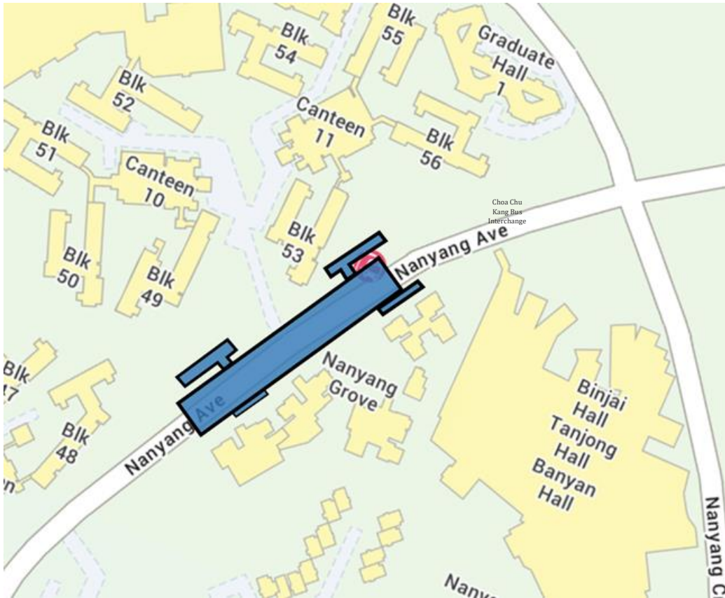
Location of JW3 Station