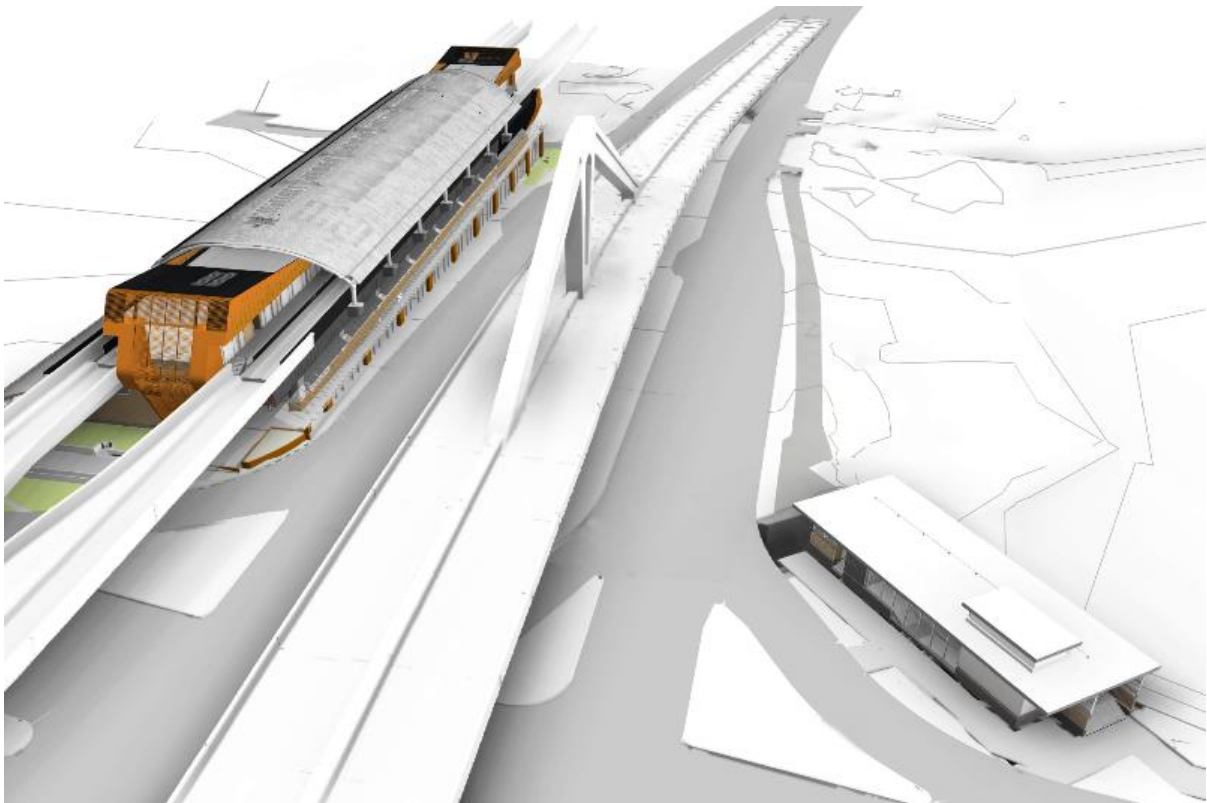
Artist Impression of JS12 Station