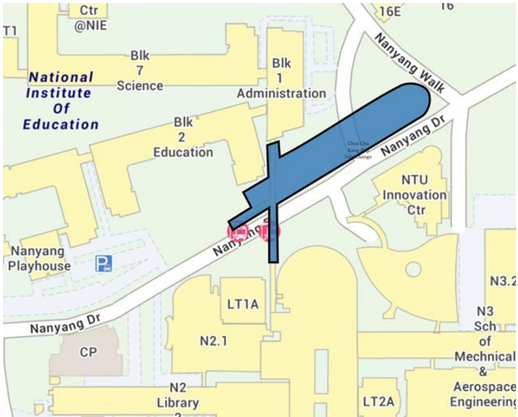
Location of JW4 Station