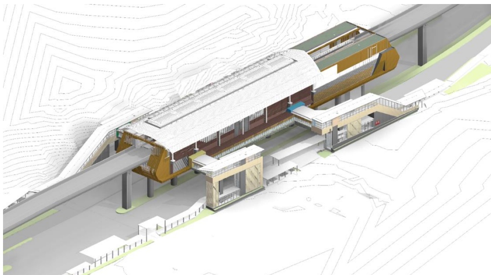
Artist Impression of JS11 Station