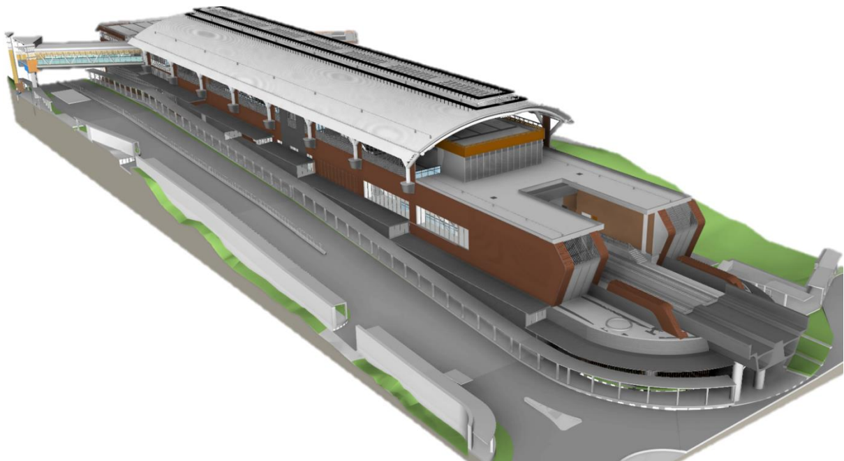
Artist Impression of JW4 Station