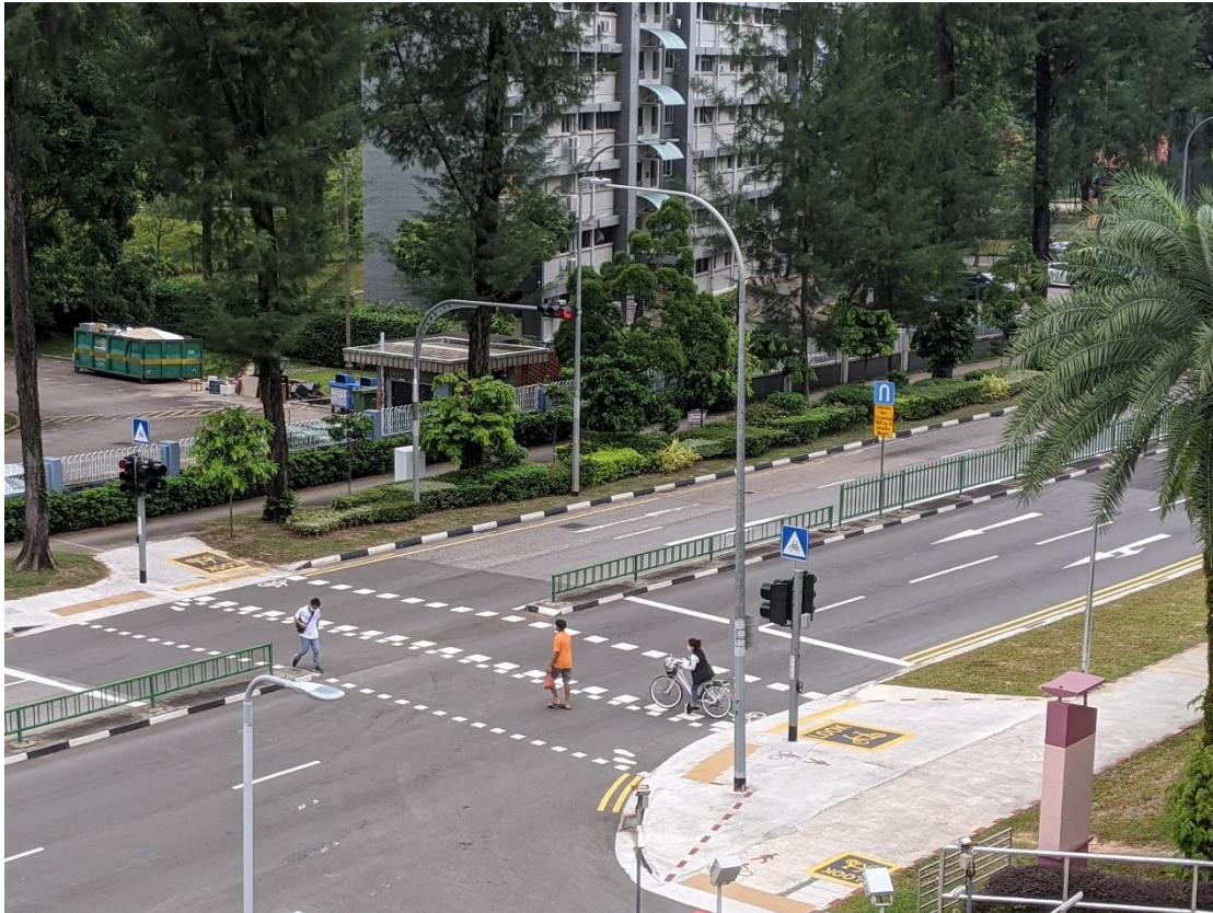
Bicycle crossing at Yuan Ching Road near Blk 119