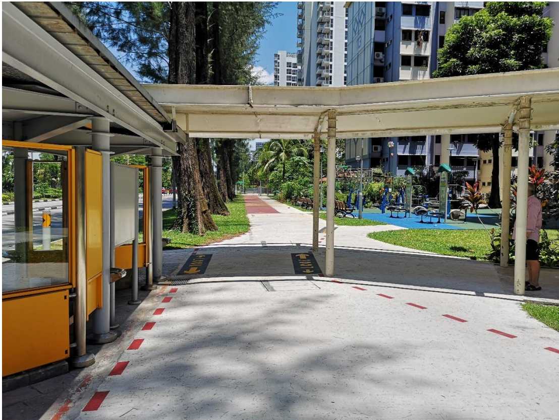
Bypass paths located behind bus stops