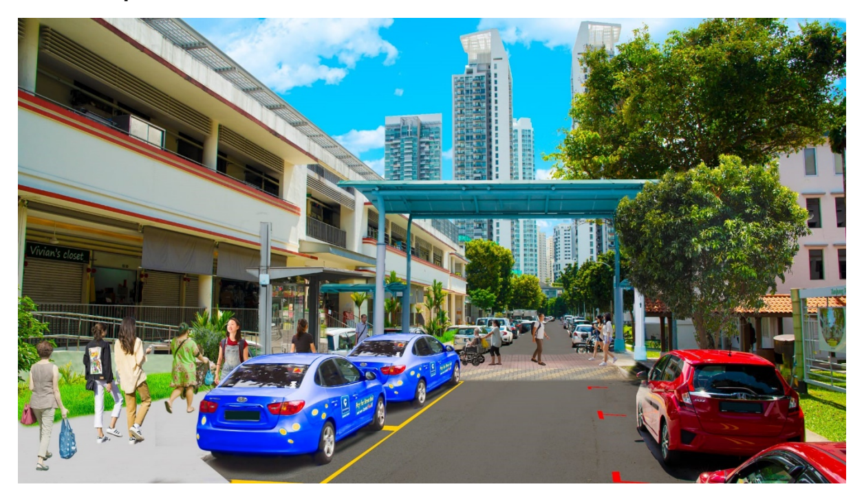
Artist's impression subjected to further changes