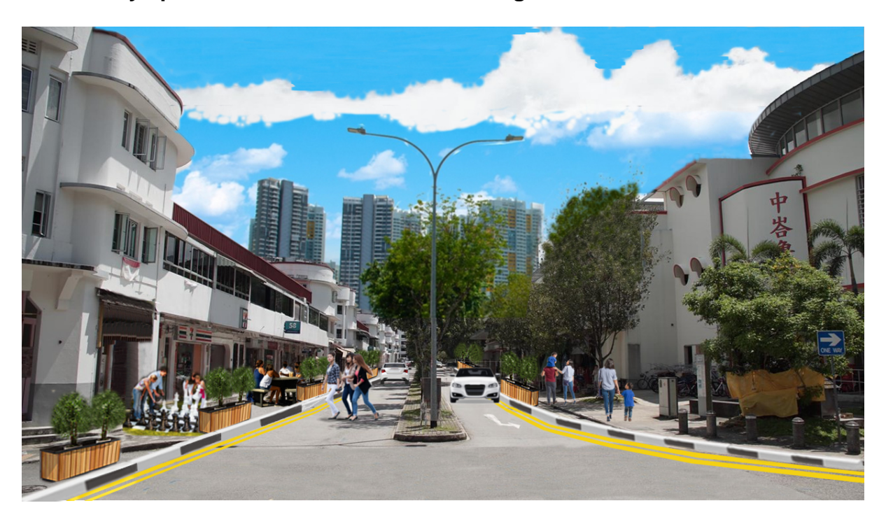
Phase 2 – Wider footpaths, more community spaces and safer crossings