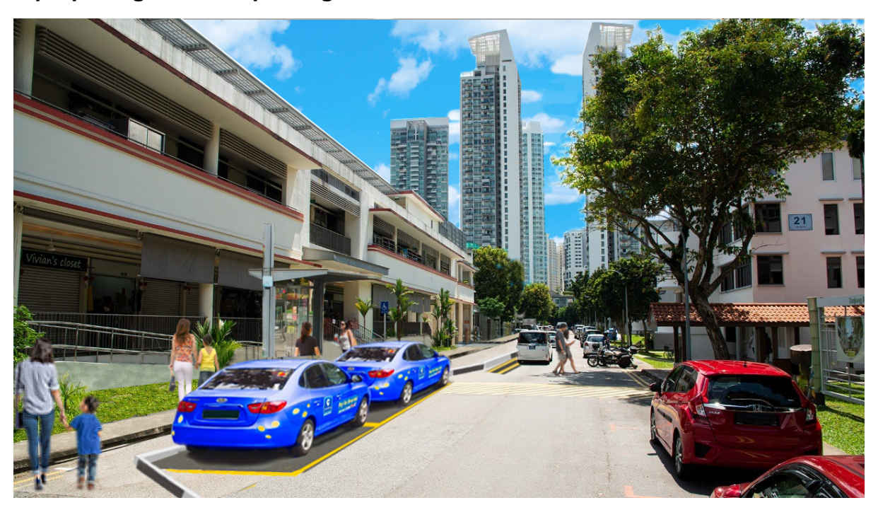
Phase 2 – Taxi stand at Lim Liak Street (fronting the Tiong Bahru Market) and wider footpaths