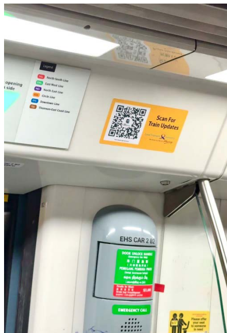
Photo 8: Commuters who are seeking train service updates while inside trains can scan the QR codes, placed beside the route maps and around the gangways.