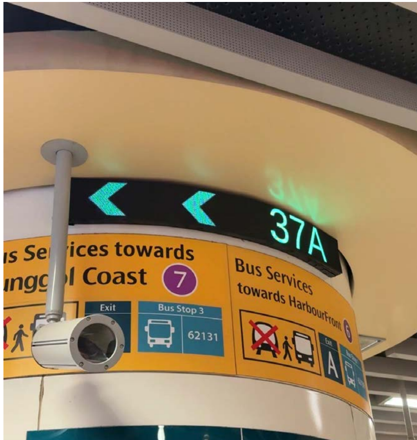
Photos 4, 5, 6: Flashing arrows are activated for commuters in the event that disruptions occur, to guide them to the closest exit or bus bridging points.