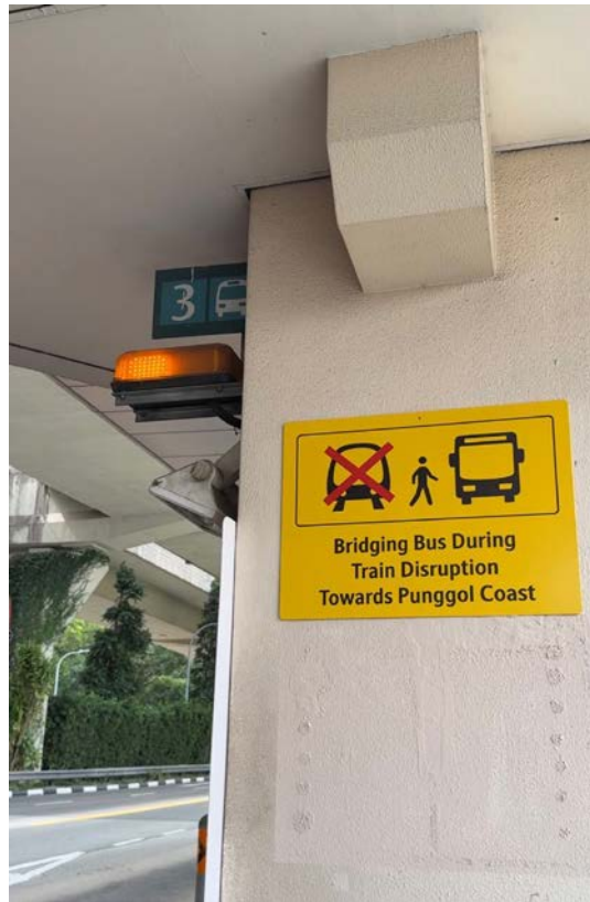
Photo 7: Permanent bus bridging point signs aim to help commuters familiarise themselves with the correct bus stops early, in the event of a disruption.