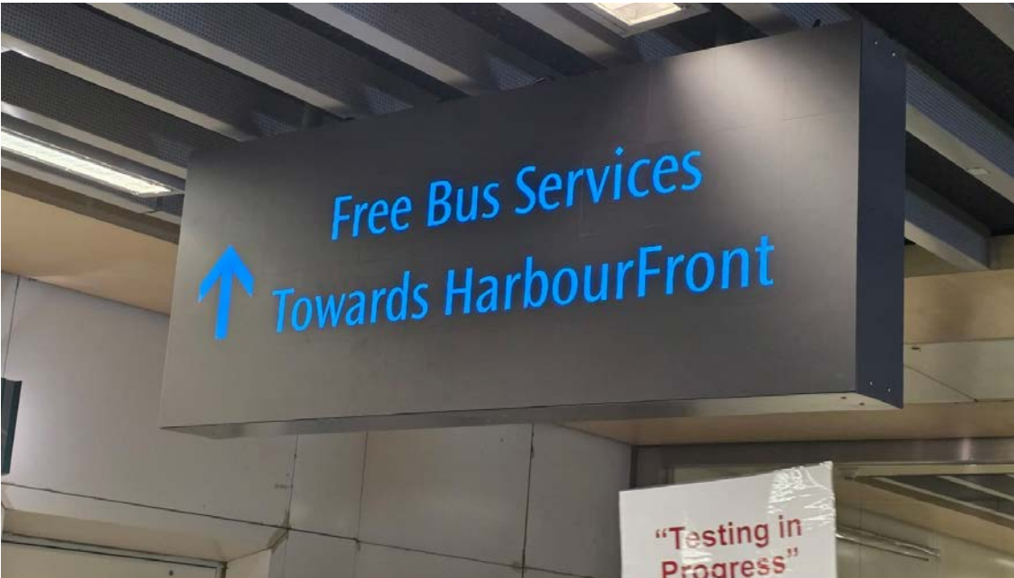
Photos 2, 3: Digital screens at key locations display regular directions during normal train services but can be switched to display directions to alternative travel options during disruptions.