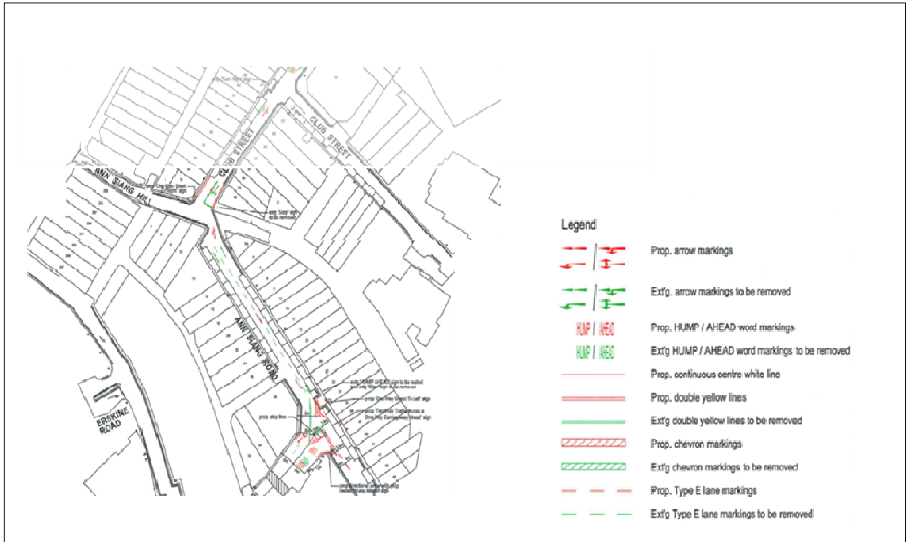
RP268SE- Conversion from two way to one way part of Club Street and Ann Siang Road Painting and Erasing Thermoplastic Arrows and Lines markings