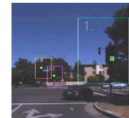
Traffic Light and Sign Detection