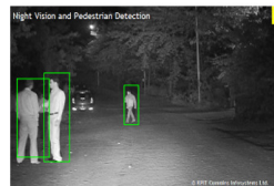
Night Vision and Pedestrian Detection