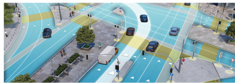
Localization with 3D LIDAR Mapping & DGPS