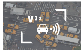
V2V and V2I Communication