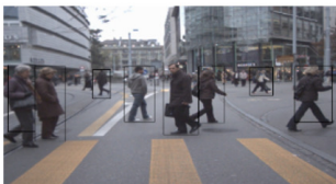
Obstacle & Pedestrian Detection with Day and Night Operation