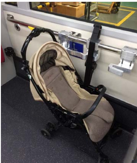
Image of secured forward facing stroller