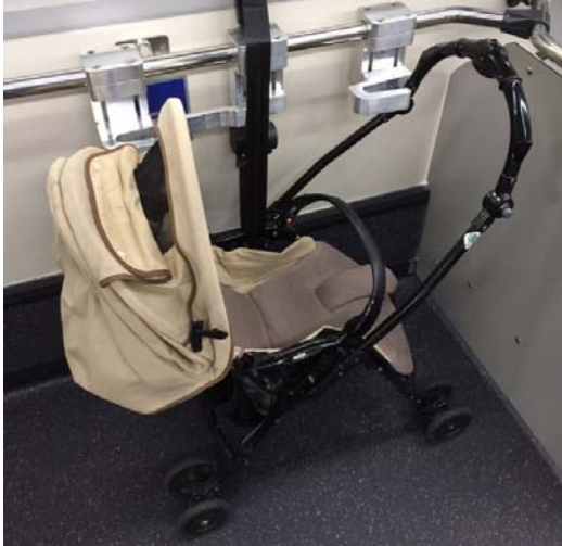
Image of secured backward facing stroller