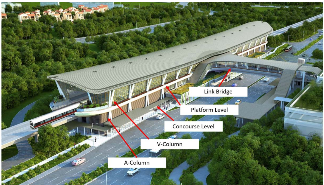
Artist's Impression of Canberra MRT Station

The "A-Columns" support the platform while the "V-Columns" support the station's roof for a sculptural effect. In addition, glass panels are used extensively to enhance the interior, with glass louvers to facilitate natural ventilation.