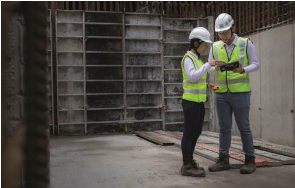
Engineers at Excavation Site by Jason Goh