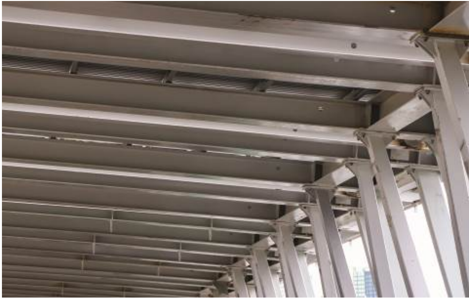
Steel Structure by Isaac Benjamin Ong