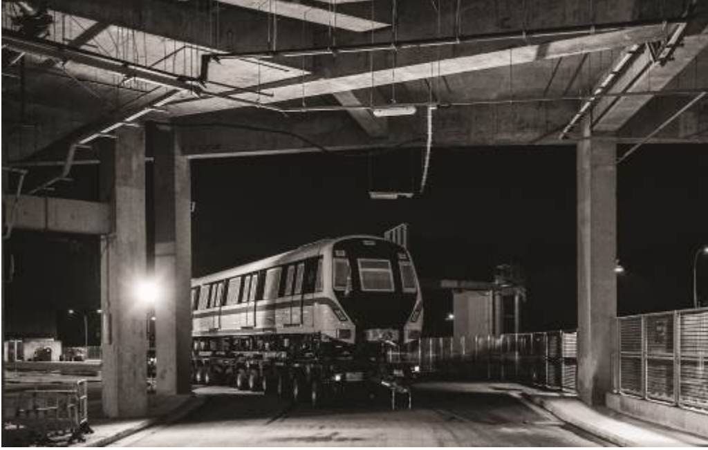
Arrival of New Trains on Site by Ryan Cheng