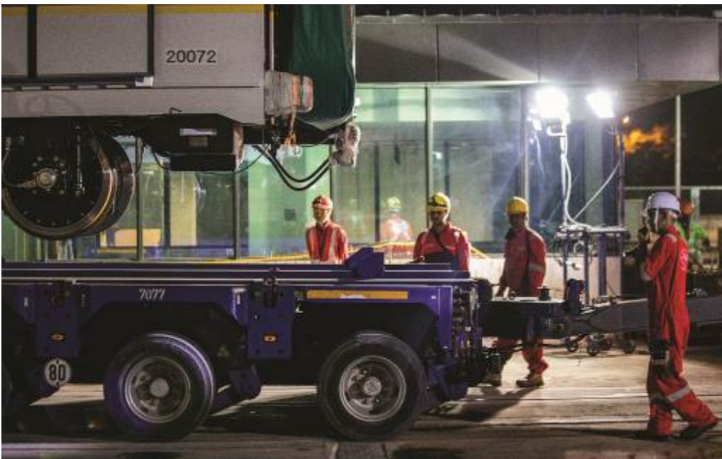
Carefully Unloading the New Train